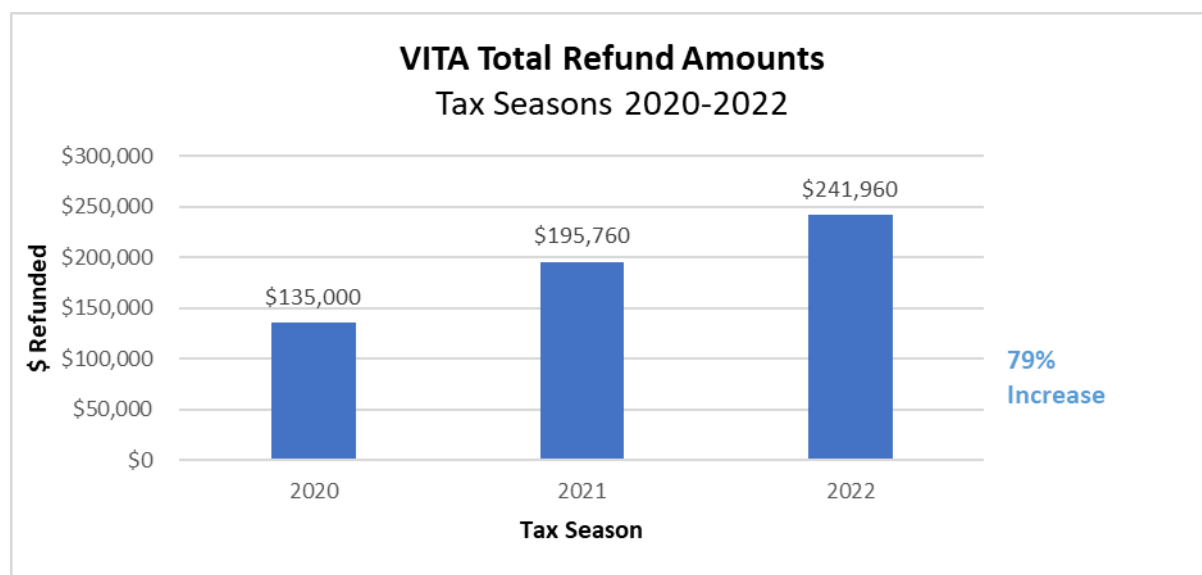
Table 1: VITA Tax Season

Overall, youth utilization of services in September through November Fiscal Year (FY) 2024 increased 19%, or 173 units of service, compared to the same time-period in FY 2023. Table